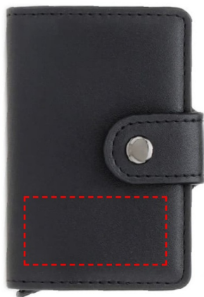
WALLET FRONT BOTTOM