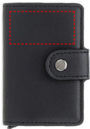
WALLET FRONT TOP